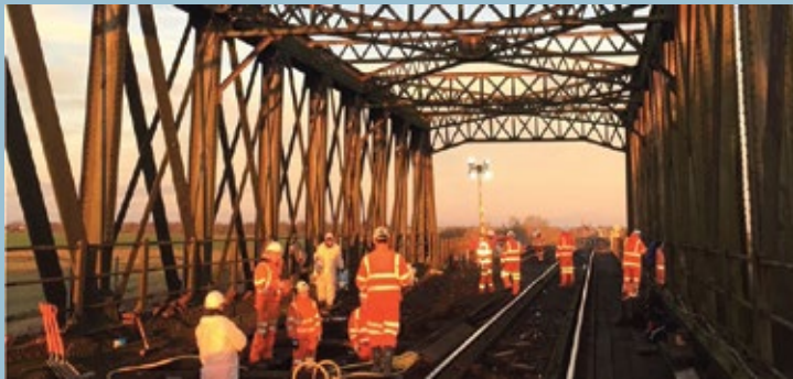
Network Rail bridge repairs at Manea July, August and October 2020