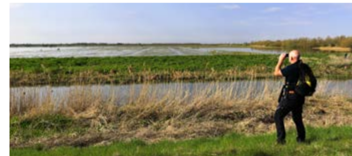
Bird Watching at The Ouse Washes.

The Welney Wetland Trust occupies over 1000 acres at the northernmost part of the Ouse Washes.