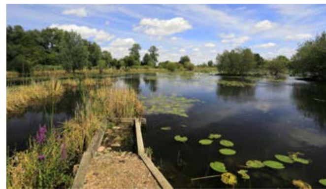
A quiet corner of Manea Pit.

To the rear of the pit is the community orchard which is home to an array of fruit trees and which is often tended to by village groups. Visitors are invited to help themselves to the bountiful supply of orchard fruits when in season.