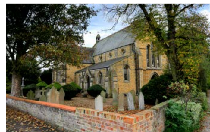
St Nicholas Church in autumn.

Represented by the Benefice of the Six Fen Churches, Manea's St Nicholas Church welcomes all to its regular services. For more details check out the Diocese of Ely's website: www.elydiocese.org/acny/march/614321/manea-st-nicholas