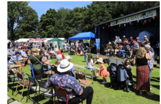
Manea Gala draws the crowds every summer.

Every Summer, the village comes alive with its annual Gala. The event is a mix of entertainment and sideshows, vintage vehicles, craft stalls and rides and attractions for all ages. Entirely run by a hardy group of volunteers, the event has been a firm fixture in the village's calendar since 1956. The group also run seasonal event at Christmas, putting up lights in the village and running a popular Christmas Fayre and putting on a tour of the village with Father Christmas and his sleigh.