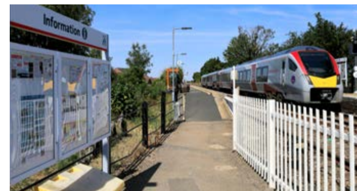
Platform 1 at Manea railway station.

The station itself is operated by Greater Anglia and as part of their Station Adoption Scheme, local volunteers are on hand to ensure that the station and its platforms always look in pristine condition.