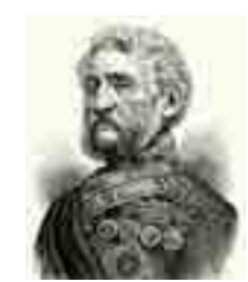
Sir Harry Smith

Whittlesey has a varied and interesting mix of streets with architecture and historical notes ranging across the centuries.