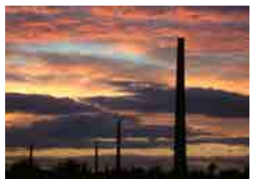
Kings Dyke, Whittlesey

The history of the site dates back to the 1920's when clay was dug by pick-axe and shovel. The site was worked out in the 1970's and was finally restored in 1995. It now offers a wonderful example of how industrial land can be transformed to benefit both wildlife and the local community. Disabled access is also available to part of the reserve. www.kingsdykenaturereserve.com