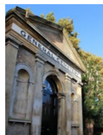
Wisbech General Cemetery